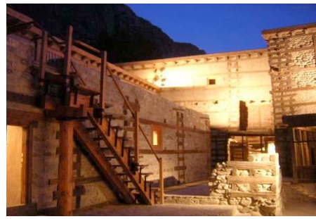
The historical Shigar Fort Residence