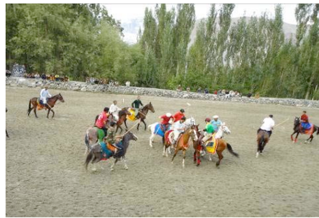
The game of the Kings – Polo!