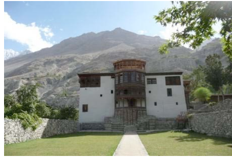
Khaplu Palace Residence in its glory!