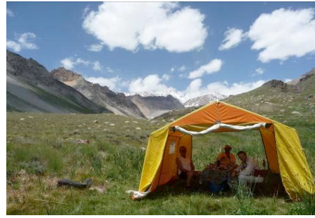
The ultimate camp site!