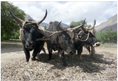
Traditional threshing techniques Shigar Valley