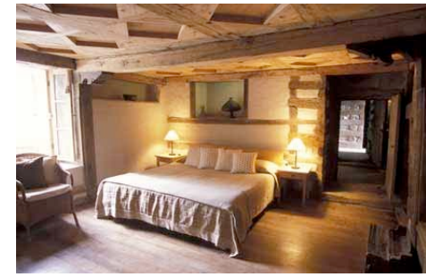
Historical luxury – Shigar Fort Residence!