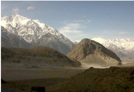
The awe inspiring mountainous landscape