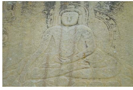
Ancient Buddhist Rock Carving, Satpara