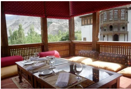
Dine in style at Khaplu Palace & Residence