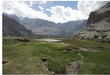
The stunning meadows of Saling