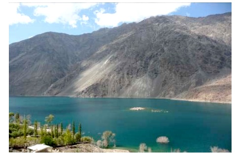
Satpara Lake, Skardu

To book your Karakoram Experience call us on +92 (051) 111-133-133 or email at holidays@serena.com.pk www.serenagitbaltistan.com