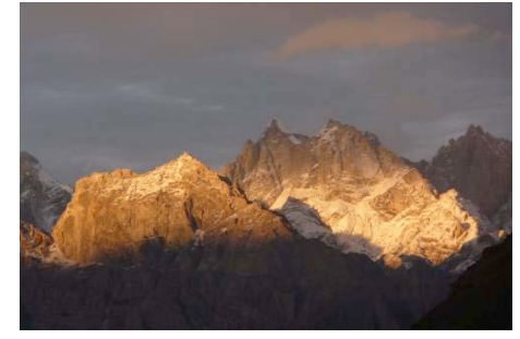
Sunset over the Karakoram